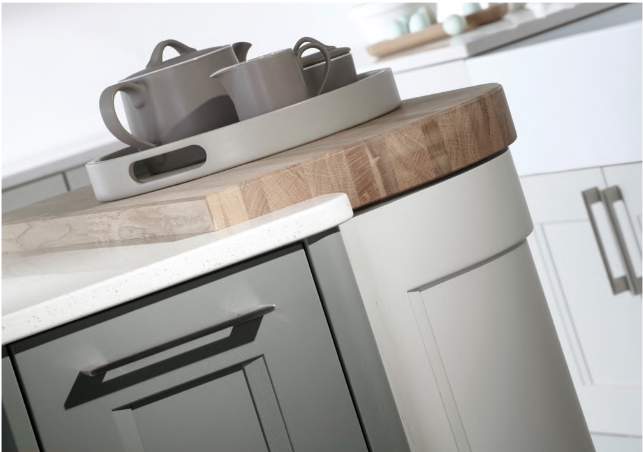
ALL IMAGES KEW IN PAINTED MINK AND PUTTY WITH HANDLE (K147)