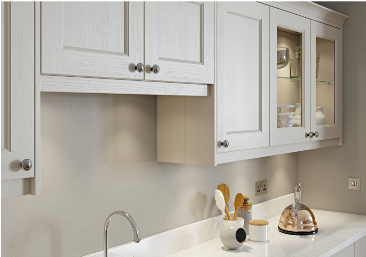
ALL IMAGES FINSBURY IN PAINTED PUTTY WITH KNOB (K144)