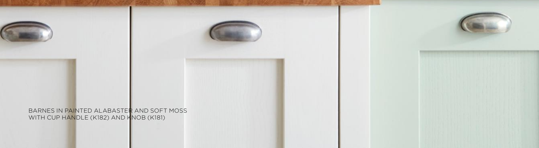
BARNES IN PAINTED ALABASTER AND SOFT MOSS WITH CUP HANDLE (K182) AND KNOB (K181)