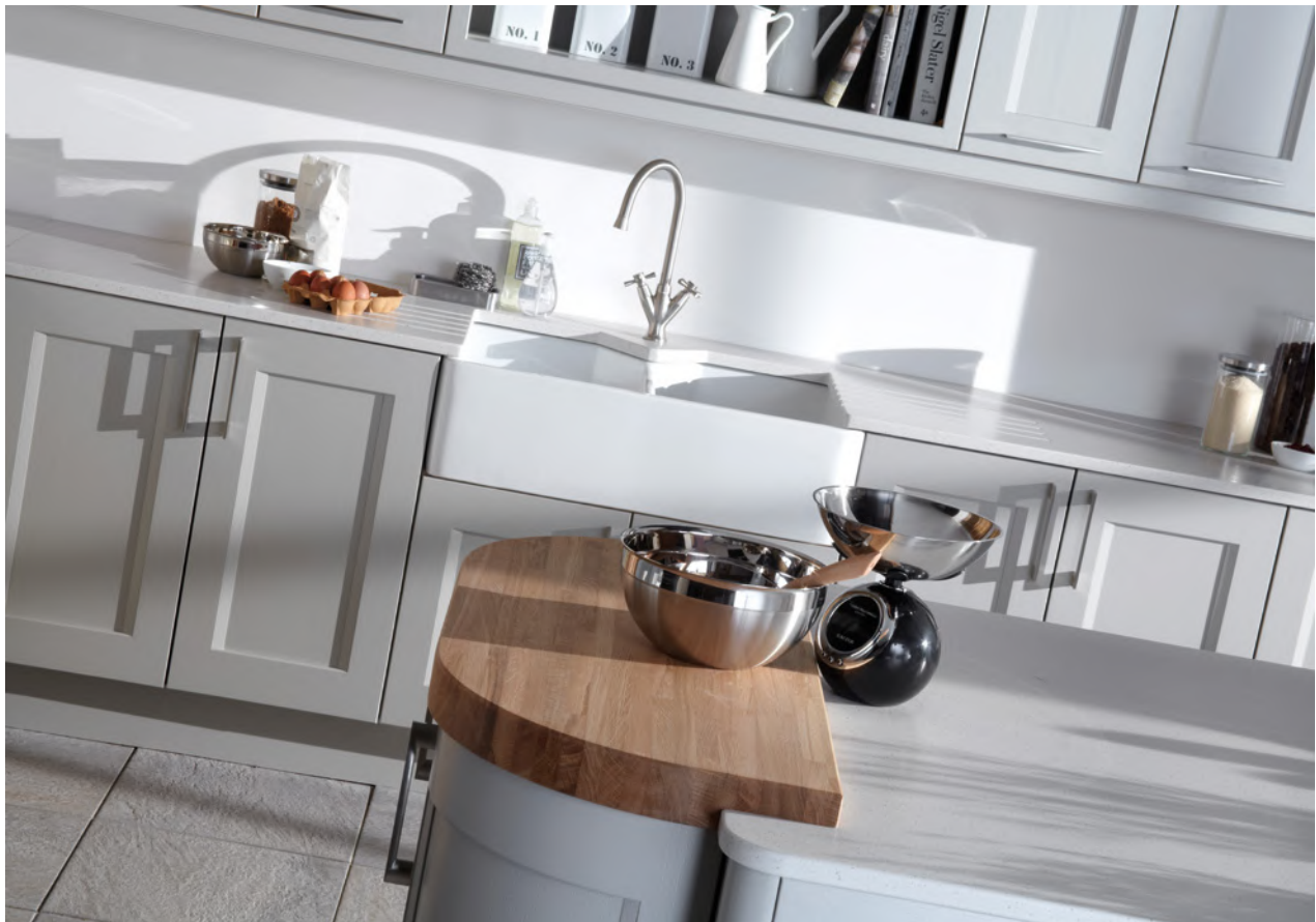
ABOVE KEW IN PAINTED SOFT GREY WITH HANDLE (K147) OPPOSITE KEW IN PAINTED SEAL GREY WITH HANDLE (K147)