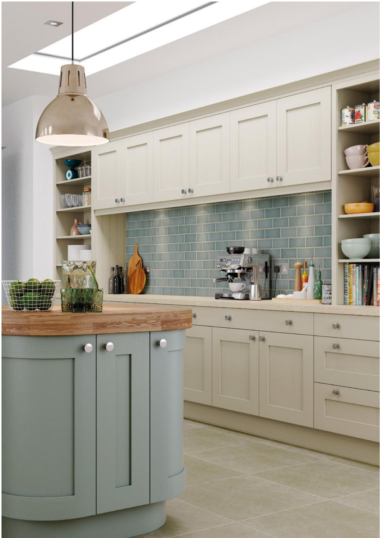
ALL IMAGES BARNES IN PAINTED ALABASTER AND FJORD GREEN WITH KNOB (K177)