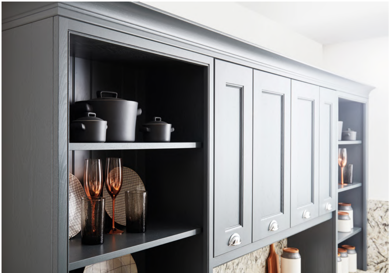
ALL IMAGES FINSBURY IN PAINTED SEAL GREY WITH CUP HANDLE (K150)