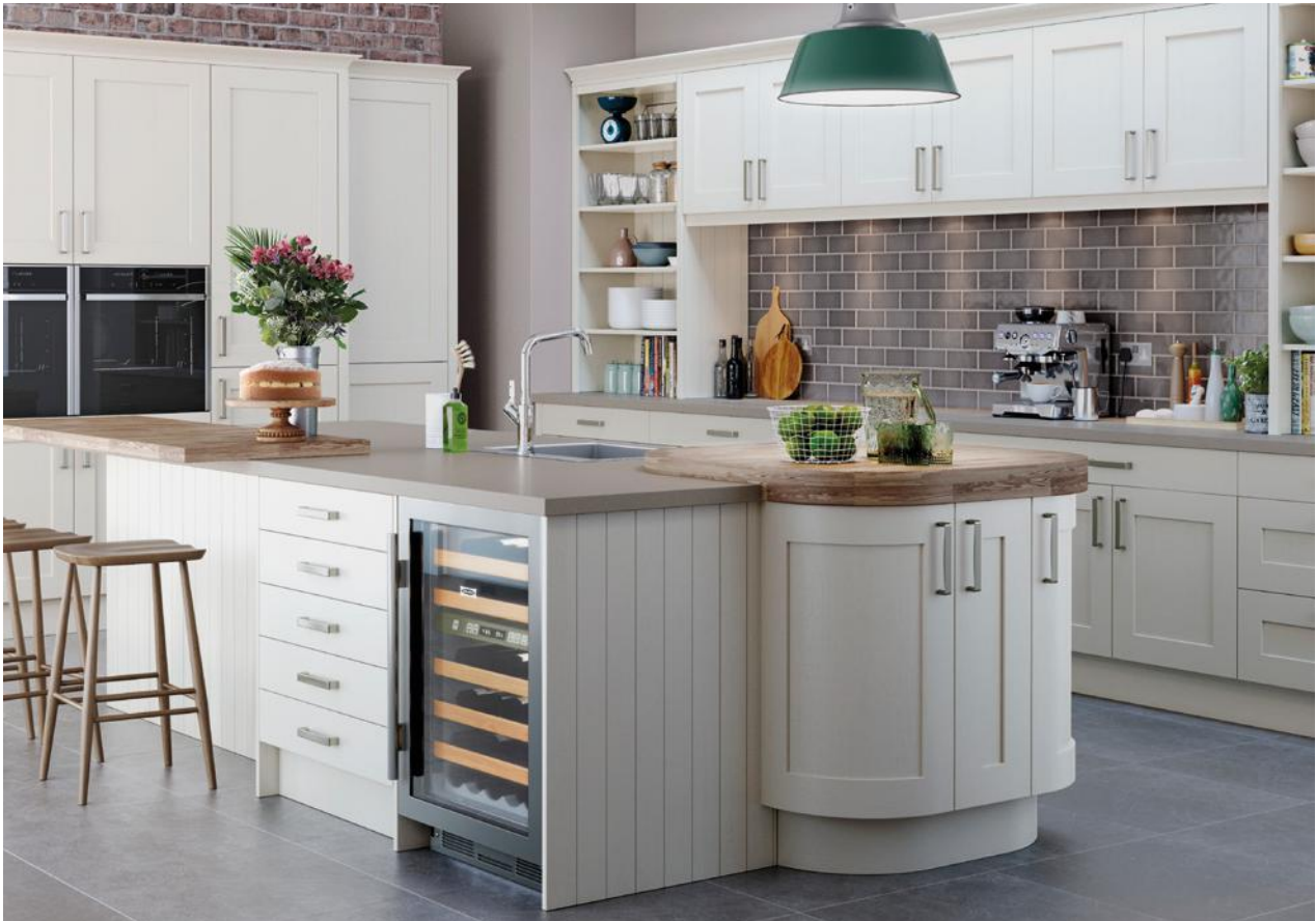
ALL IMAGES BARNES IN PAINTED ALABASTER WITH HANDLE (K163)